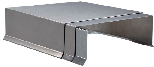
Roofers Edge Coping (Tapered Version)